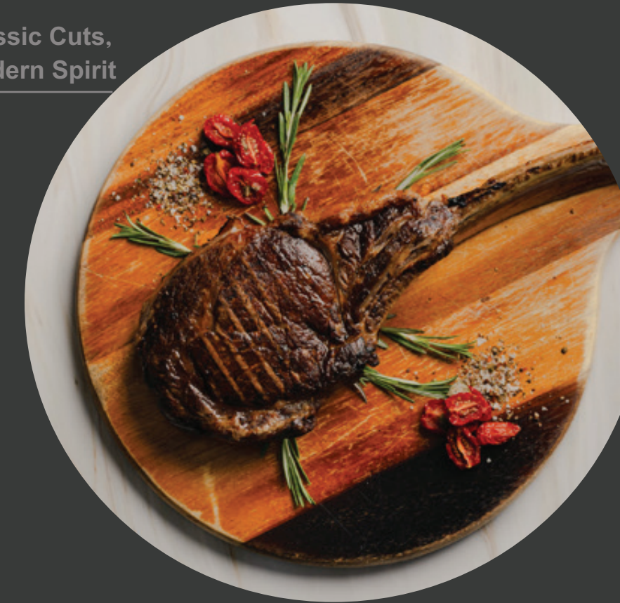
Classic Cuts, Modern Spirit