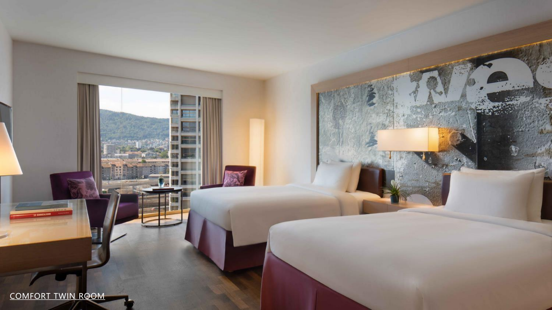
COMFORT TWIN ROOM