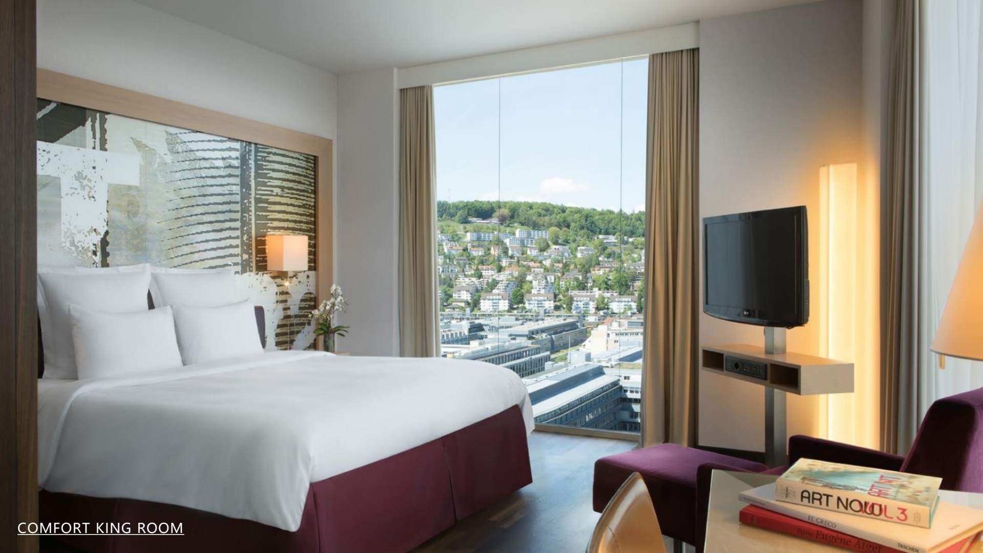
COMFORT KING ROOM